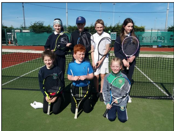
Termonfeckin Schools Tennis Team which is currently competing in the Leinster Primary Schools Tennis League.