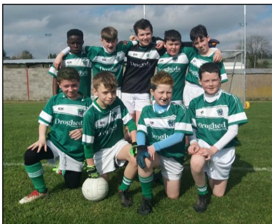
Scoil Naomh Feichin Boys Gaelic Football Team