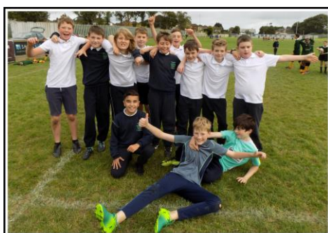
5th & 6th Class boys at the Tag Rugby Blitz